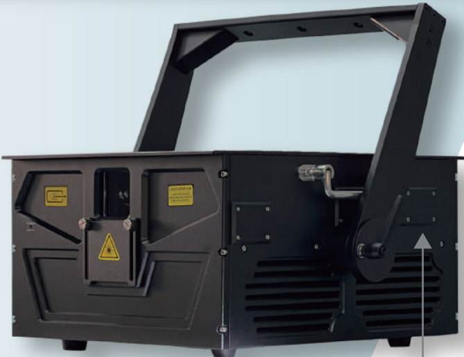
[RGB alignments window]